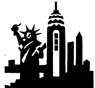
...government, of the people, for the people, by the people...

The October meeting addressed some of the facts of Charter Government in Collier.